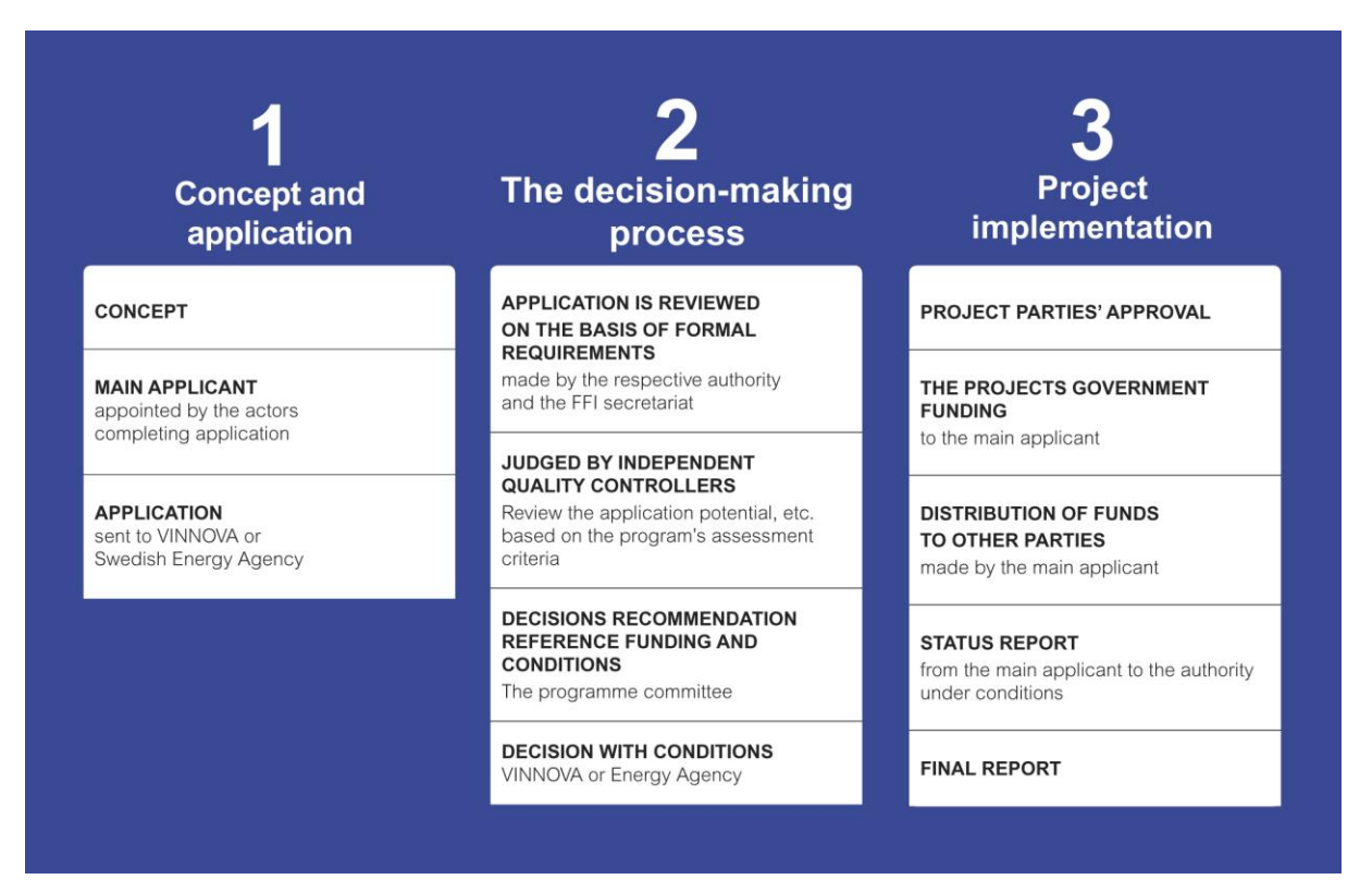
Figure 2. Project generation, the decision-making process and project implementation

The following is a brief description of the process from concept to the project conclusion. This process is common to all sub-programmes and strategic initiatives within FFI. The figure below shows the various stages of a project's "life cycle".