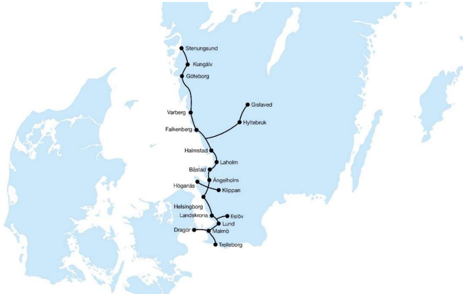
Figure 1.1: The main outline of the Swedish natural gas network.

Dragør (in Denmark) is 8.6 mcm/d. The natural gas network consists of approximately 620 km of transmission lines and 2 700 km of distribution lines. The network has one aeration station and about 40 M/R stations, which are connected to the distribution networks. Figure 1.1 illustrates the main outlines of the network.