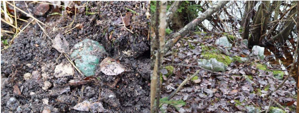
Figure 2. Pictures from Målerås glass landfill.

The cleaning costs for each glass mill have been estimated at approximately SEK 10-50 million per item if carried out using traditional landfill technology. The options used today to take care of old glass wastes are to transport the excavated materials to another landfill or to cover the waste in place so the leaching of heavy metals decreases. The project “Glass deposits - from waste to resource” have shown that on a small scale it is possible to separate metal and glass so that the remaining glass contains less than 0.1% by weight of lead. Recycling of metals and glass also contributes to the reduction of new resources. Handling the glass waste is necessary for the built environment around glass dumps to be good and facilitates the preservation of the cultural and industrial history buildings in the glass industry. Recontamination is required for the re-establishment of activities in disused glass works buildings and -environments.