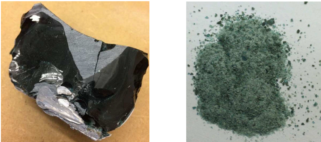
Figure 7. To the left: crucible divided with diamond saw, the glass phase and the lead phase can be seen. To the right: glass phase crushed with a mortar and pestle.