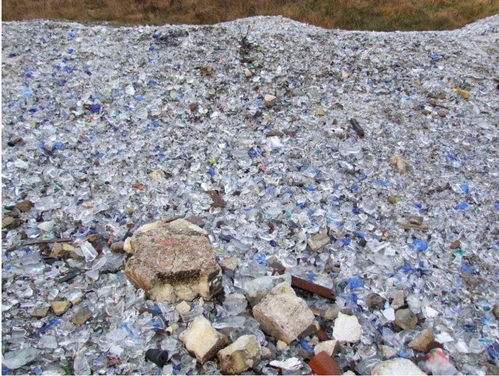
Figure 1. Madesjö glass landfill.