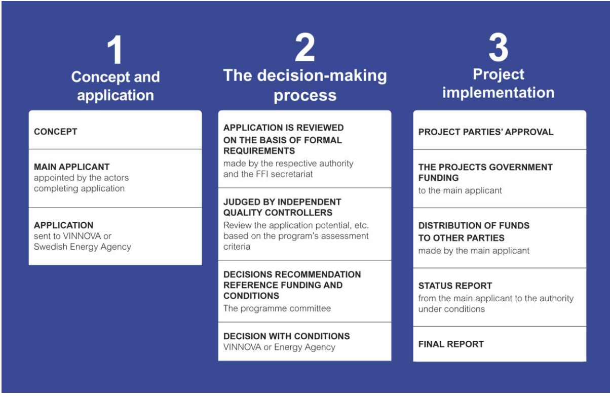
Figure 2. Project generation, the decision-making process and project implementation

The following is a brief description of the process from concept to the project conclusion. This process is common to all sub-programmes and strategic initiatives within FFI. The figure below shows the various stages of a project's "life cycle".